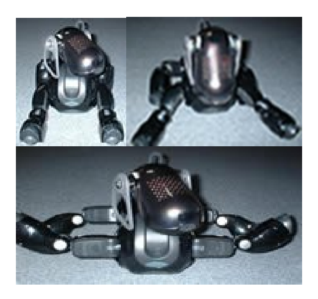
Figure 3. Aibo 'stretching', indicating its readiness to search the Internet

Once a response email is sent back to the user, the dog sits very much like a watchdog. Our Aibo-based Iolaus's head sways from side to side (Figure 4) as if looking for an interesting game to play while it searches and waits for user's next emailed request. As an added method of physically conveying its virtual state, Aibo also flashes its LED lights on its head, back and face when it is in the process of sending and retrieving emails. The lights will turn off when Aibo is awaiting a user request.