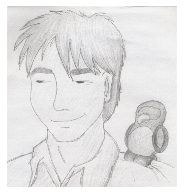
Figure 1. Iolaus-a conceptual drawing

Our short-term design goal is to be able to ask Iolaus to locate a person in a room in a socially acceptable manner. The person Iolaus is asked to seek can either be physically in the room or be represented by a picture. The robot must then decipher the request in such a way that it can search for the information requested. The search for