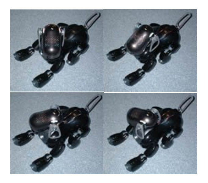
Figure 4. Aibo's head turning waiting for a new query.