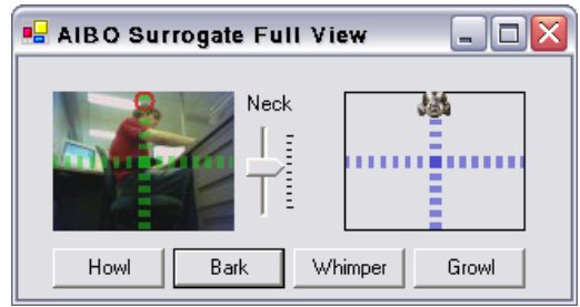
Figure 2. Full Window view of the AIBO Surrogate Item

the robot sees, giving the distant group a first-person view and awareness of robot activity, informing the group when the robot is moving and when it's looking around. If a group member is currently controlling the robot, the in use indicator is checked. The Figure 1 tile view shows that the robot is currently being controlled. The CB chat supports this, where one person says "I'm using the AIBO Surrogate to look for Rob", and the other suggests where to find him. The group sees the robot's view as it moves towards Rob's desk and looks up at Rob. Figure 3 shows that in the real world the AIBO is behind Rob looking up at him.